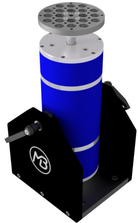
Figure 1: X-Act 325 shaker with 115mm mounting table for component testing

The X-Act 325 is a universal electromagnetic shaker with a force of 300N sine pk and a maximum displacement of 25mm pk-pk. Unlike conventional shaker systems, the X-Act 325 can be cooled with air or water as standard. The much more efficient water cooling allows the X-Act 325 to operate continuously and quietly at high excitation forces where otherwise only bigger, more expensive and noisier air-cooled shakers can be used. The compact dimensions and low weight enable mobile use and ease the positioning and alignment of the system. For component testing, an exchangeable shaker table with a diameter of 115mm and integrated M6 threaded inserts is used. For modal analysis the vibration table is simply exchanged for a collet chuck. Due to the low weight of the moving element, interactions with the structure to be examined are minimized while maximizing the peak accelerations. A through-hole in the moving element also allows the use of pretensioned wires to introduce the generated dynamic forces into the structure under investigation. When using a stinger, the length of the stinger can be adjusted by clamping it in a chuck. Due to the high radial stiffness and rigidity the X-Act 325 is significantly less sensitive to transvers forces compared than typical modal shaker systems.