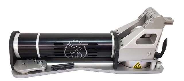
Picture 10: ALPHA 2025 in movable MLB-Base ("Movable Lever Base") with integrated 2:1 lever arm and electromagnets for electromagnetic clamping

For testing larger and heavier components in horizontal direction, the use of a horizontal moving table is recommended to avoid inadmissibly high bending moments on the bearing of the moving element inside the shaker. The magnesium mounting table with air bearing linear guides has a mounting surface of 450mm*300mm with M6 threaded inserts on a 50mm*50mm grid pattern for mounting the test specimens and allows frictionless motion with very low lateral accelerations.