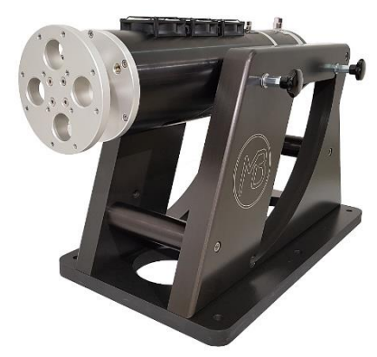
Picture 8: Trunnion base allows quick and easy change between vertical and horizontal orientation of the ALPHA shaker

All ALPHA shakers can be combined with mounting tables in different sizes. As standard sizes, mounting tables are available with a diameter of 198mm and 278mm. M6 threaded inserts on a 50mm*50mm grid pattern allow easy mounting of the test specimens. The mounting tables themselves are attached to the moving element of the ALPHA shaker by four screws. Other special sizes are of course available on request.