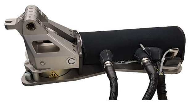
Picture 4: Thermally insulated, water-cooled ALPHA 2025 on movable lever base with integrated magnetic clamping