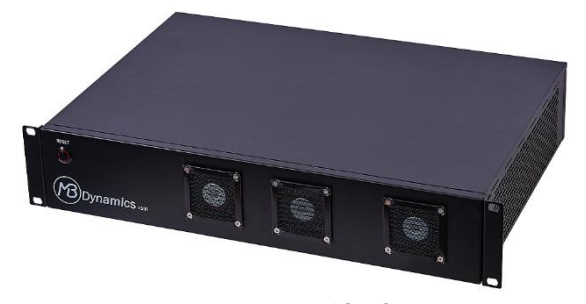
Picture 6: MB A500 power amplifier for ALPHA 1025 and ALPHA 725 shakers